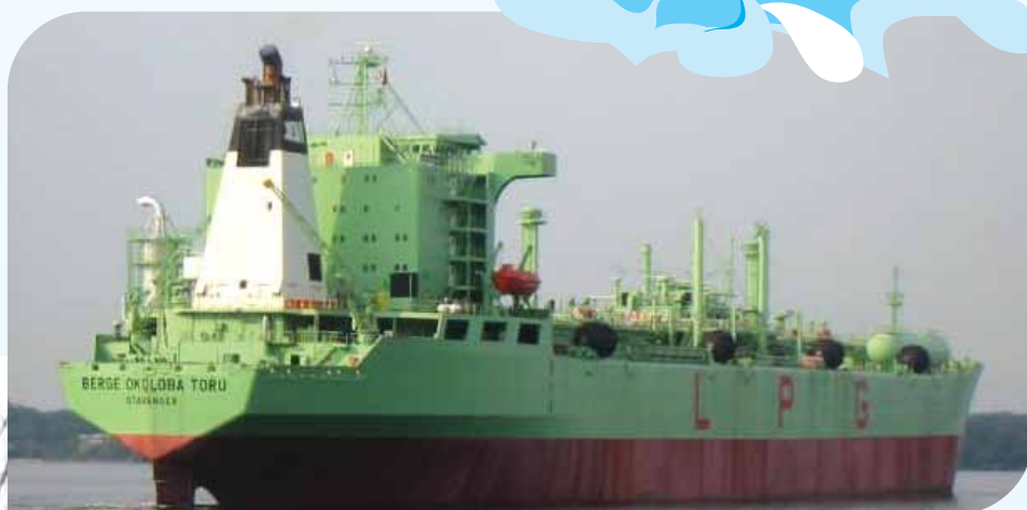
Completed the world's first LPG FPSO conversion on Bergesen Offshore's LPG carrier Berge Sisar which was renamed Okoloba Toru in December 2004