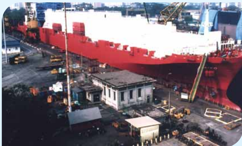
Series of repairs to 12 vehicle carriers/ro-ro vessels from Barber Ship Management