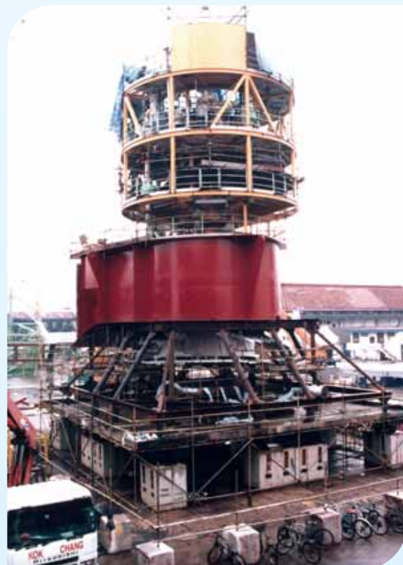
Fabrication of FPSO's turret main body, supporting structures and topside structures for APL Norway