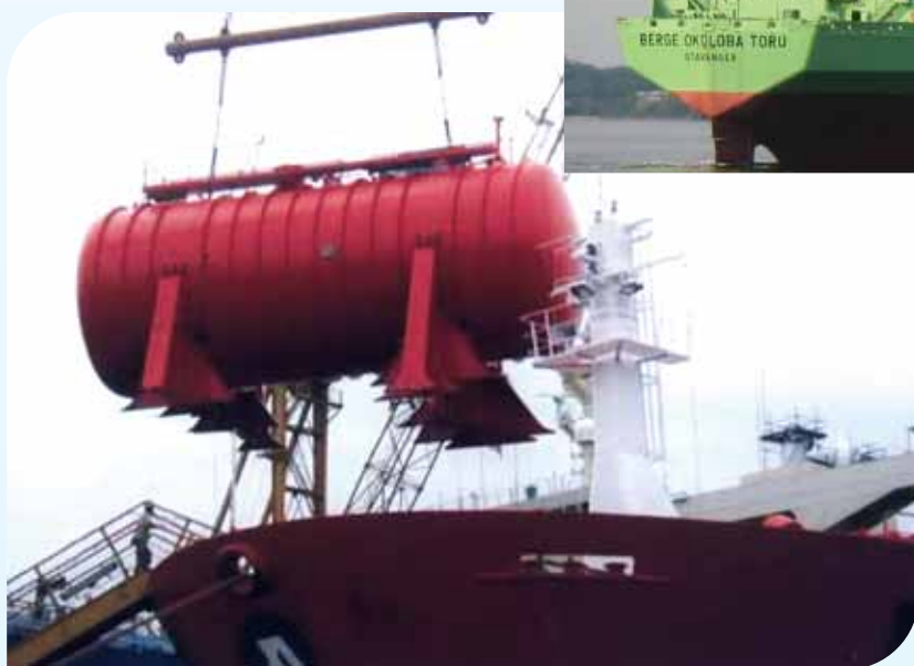
Deck tank installation and repairs of chemical tankers Jo Cedar and Jo Syress for Jo Tankers AS in 2004/2005