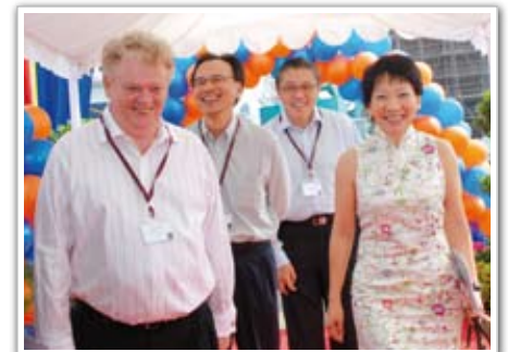
Senior Minister of State, Ministry of National Development & Ministry of Education, Ms Grace Fu (extreme right).