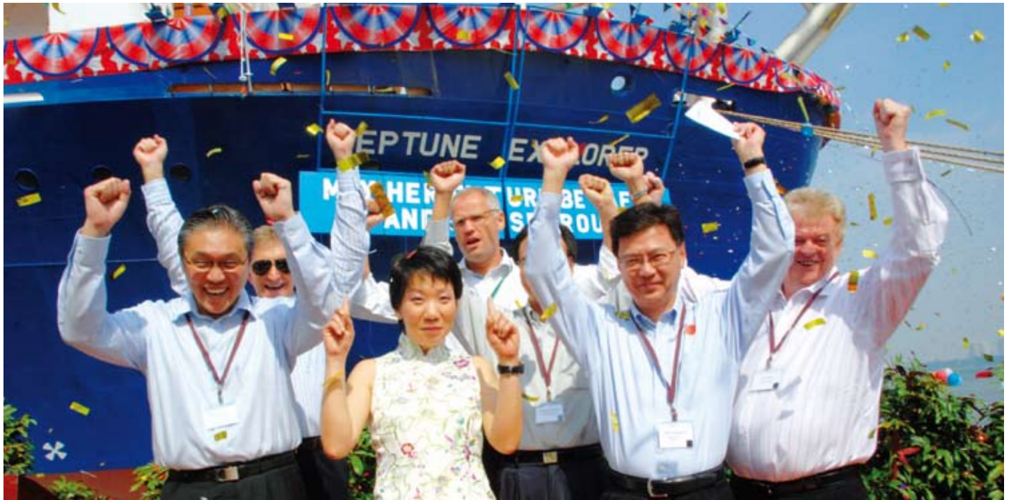
VIPs in celebration of a job well done!