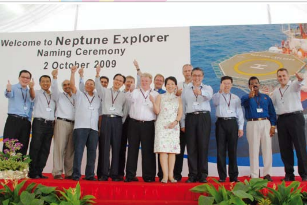
Thumbs-up to the successful upgrading of Neptune Explorer!