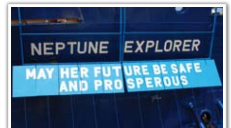
Well Wishes for Neptune Explorer.