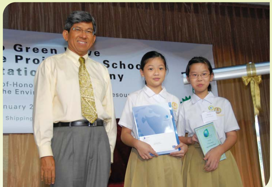
1st prize winners from Qihua Primary School