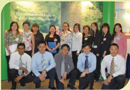
The dedicated working team from SSPL