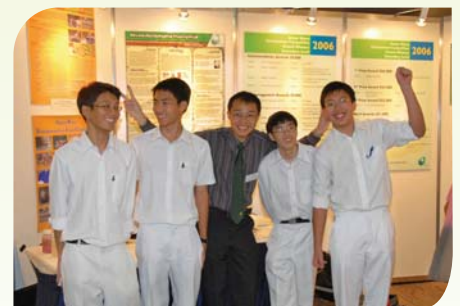
All the happy faces of winning teams!