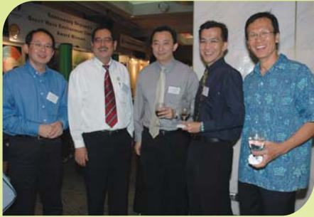
Some of our dedicated and hard working Green Wave judges at the ceremony