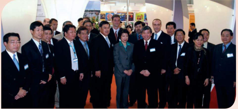
Delegation from Singapore being led by Mrs Lim Hwee Hua, Minister of State for Finance & Transport, during the official opening ceremony on 5th June 2006.

Greece is one of our biggest markets for ship repair and we enjoy strong support from major Greek shipowners