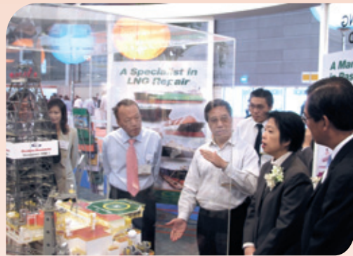
Mrs Lim Hwee Hua, Minister of State for Finance & Transport, being briefed on the group's development plans by SembCorp Marine's representatives.

We exhibited in this premier shipping show jointly with SembCorp Marine in March 2006. This major maritime event in Singapore was officially opened by Mrs Lim Hwee Hua, Minister of State for Finance & Transport and attracted more than 5500 visitors from 55 countries. Our representatives at the show took the opportunity to meet our customers and business associates including overseas customers who had specially flown into Singapore to attend the exhibition.