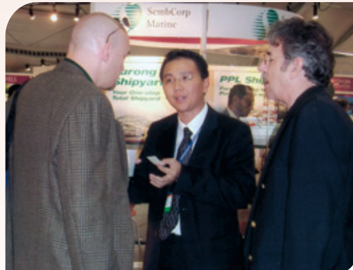
Our representatives with customers and visitors to our stand.