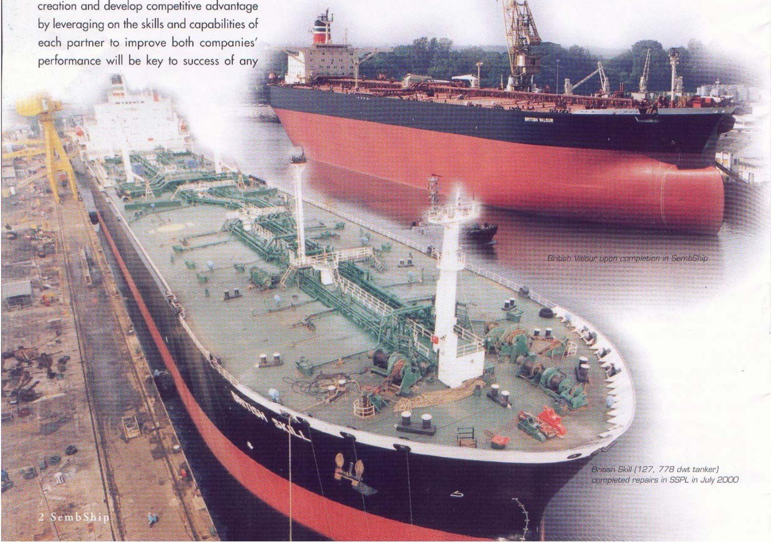
British Valour upon completion in SembShip

With the signing of this alliance, we now have a total of four alliance agreements, namely with Shell International Trading and Shipping Co. Ltd (United Kingdom), BHP Transport and Logistics (Australia) and Jo Tankers AS (Norway). We are of the view that such alliances with international shipowners and operators will be the way forward in forging long term business relationships leading to synergistic value creation for the shipyard and its alliance partners. 📞