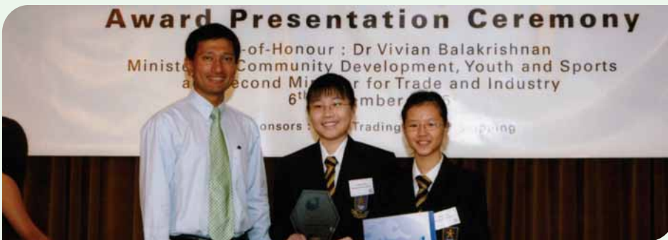
1st prize winners from Hougang Secondary School with their winning project titled "Recycling of Hairs"