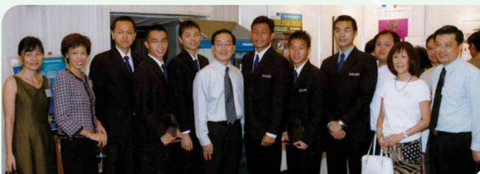
Winners from Ngee Ann Polytechnic