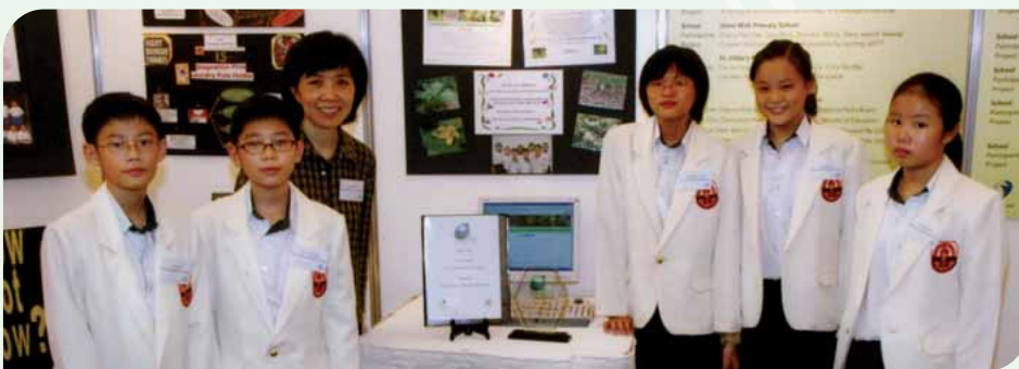
1st prize winners from Princess Elizabeth Primary School with their winning project titled "Flora and Fauna of Bukit Batok Nature Park"